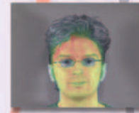
Co-Registered Visible-Thermal IR